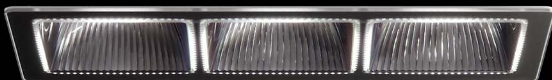
Black, like rare crystals

recalling the harmony of natural elements. Softer colours shaded by the transparency of the optics to enhance depth and prestige. The two finishes add character to the setting while always being elegant and neutral. Maximum compactness ensuring minimal use of material, thereby facilitating sustainability and installation flexibility, even with small false ceilings.