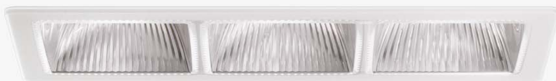
White, for volume to purity